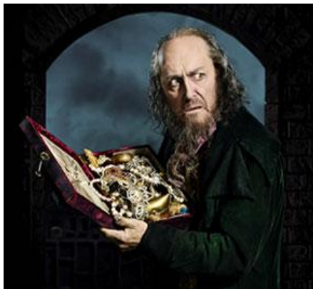
Fig. 3- Griff Rhys Jones as “Fagin”.