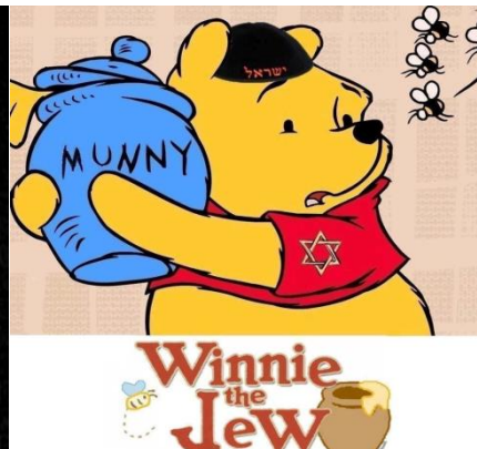
Fig. 4- “Winnie the Jew”.