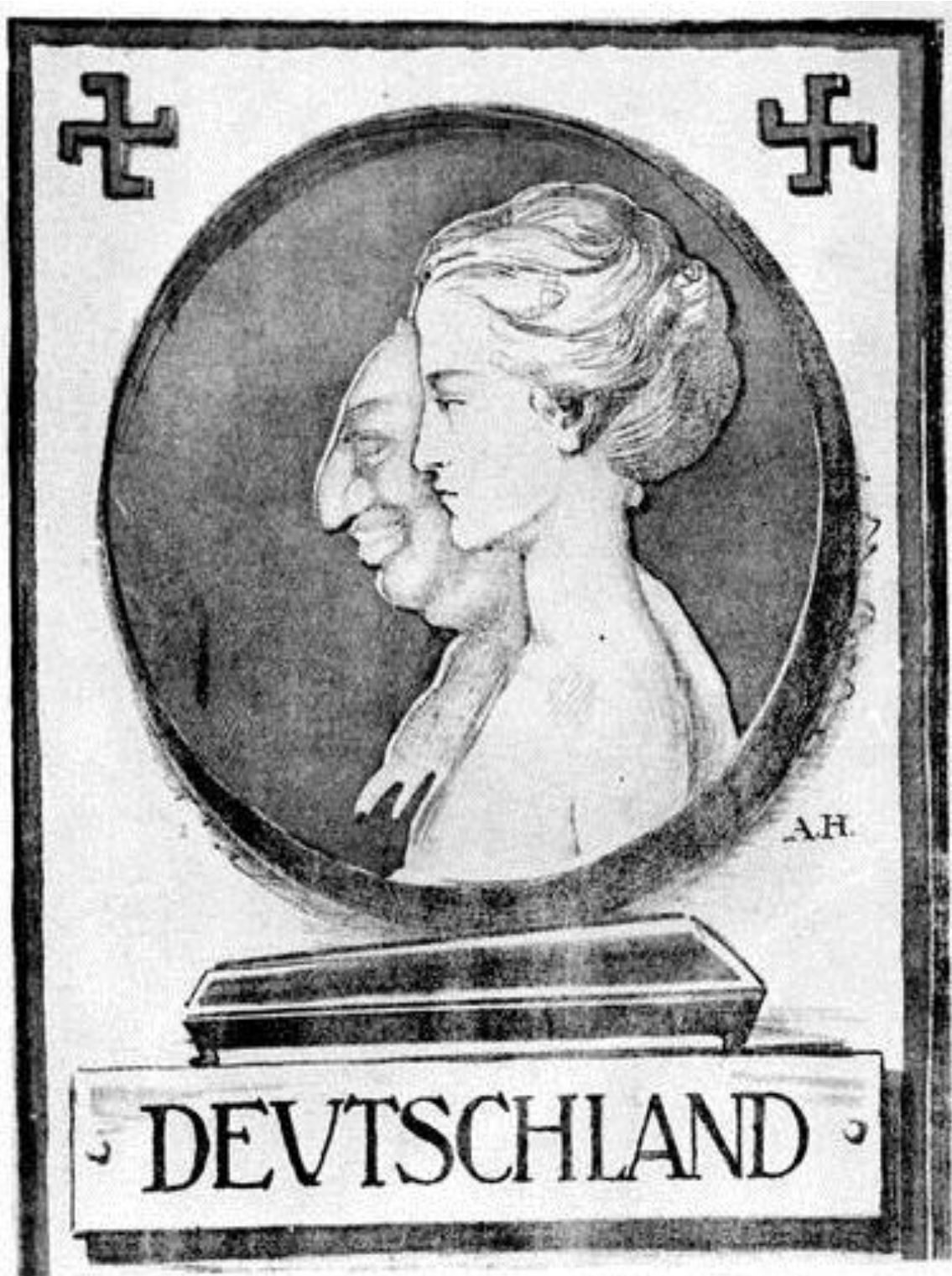
Antisemitisches Wahlplakat zur Reichstagswahl. 1920